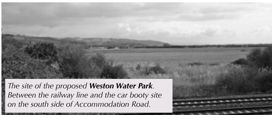
The site of the proposed Weston Water Park. Between the railway line and the car booty site on the south side of Accommodation Road.

We'll keep you posted in future issues of Bleadon Village News. Or contact Alistair at: a.house@farmline.com